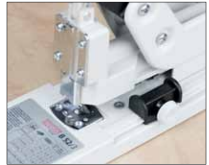
Adjustable depth guide ensures you staple at the desired depth each and every time.